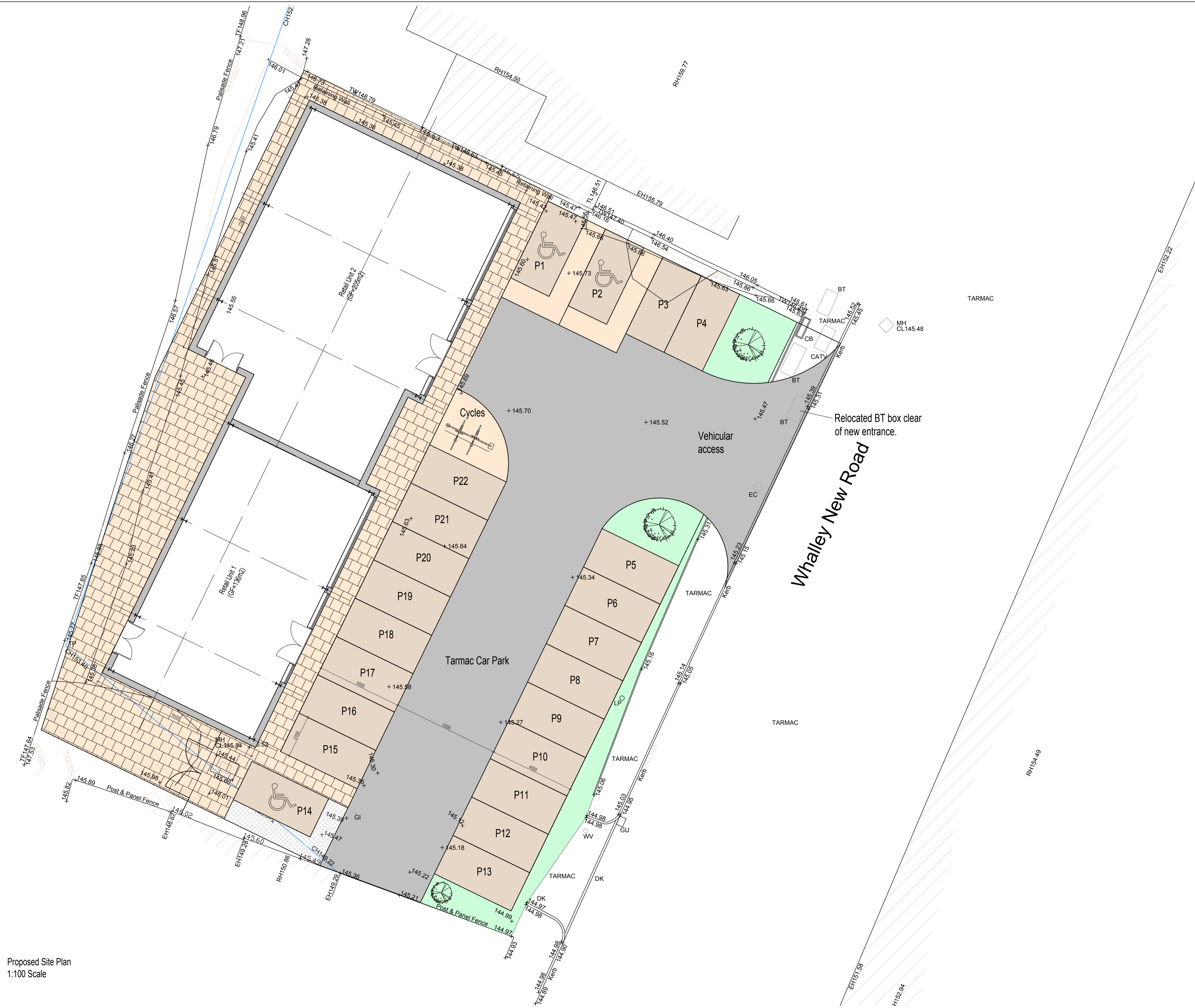
Proposed Site Plan 1:100 Scale