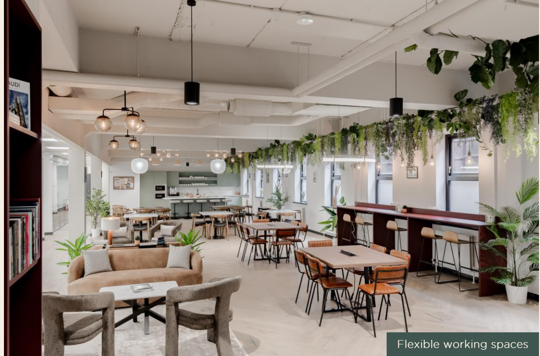
Flexible working spaces